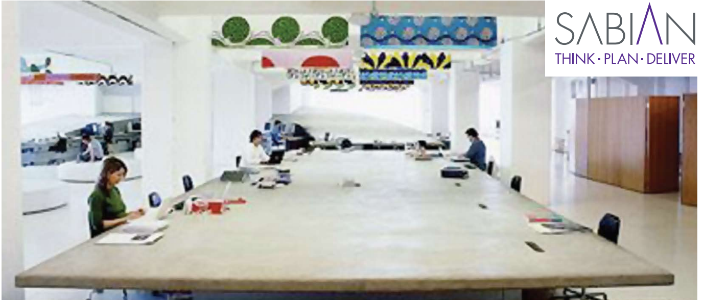
One we did not help with – Mother Advertising in London