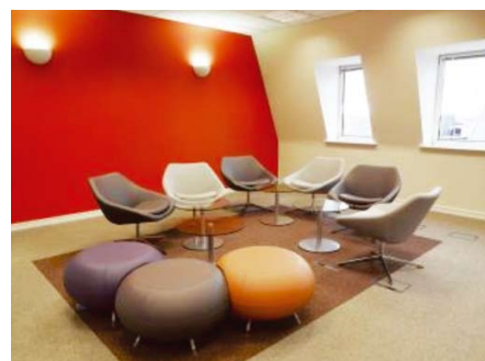
Severn Trent's streamlined new call centre offices

It is in the hard facts and figures that recent work with Severn Trent has produced which really make people sit up and listen. We worked with them to create a large contact centre which due to a smarter location and the creation of a working environment to be proud of (see images above) – have ended their need to rely on expensive agency staff. When estimated savings in this area exceed half a million pounds, it is not to be sniffed at.