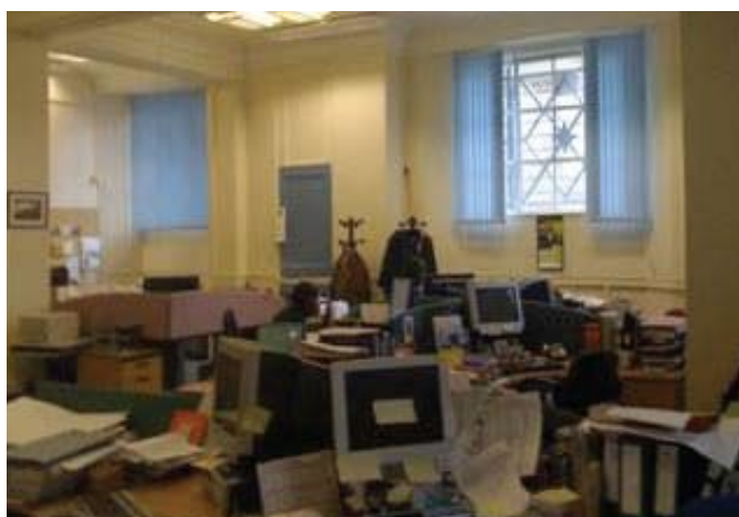
Birmingham County Council's modernised new offices before

"If you think it is expensive to hire a professional to do the job, wait until you hire an amateur".