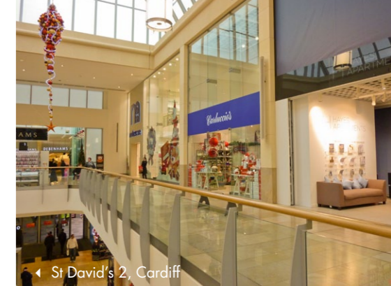
St David's 2, Cardiff

This site has built on Sabian's strong track record of successful short-term leasing. It features creative dressing of empty space to improve the visitor's shopping experience by linking active trading areas seamlessly. The big benefit for landlords is the ability to dress mall areas quickly whilst meeting lease and time requirements.